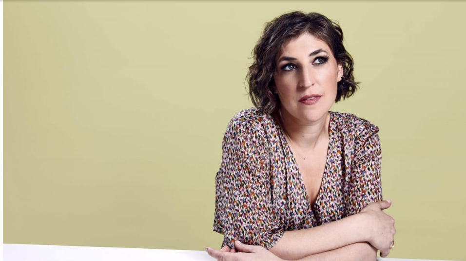
Dr. Mayim Bialik, star of new Fox sitcom, "Call Me Kat."