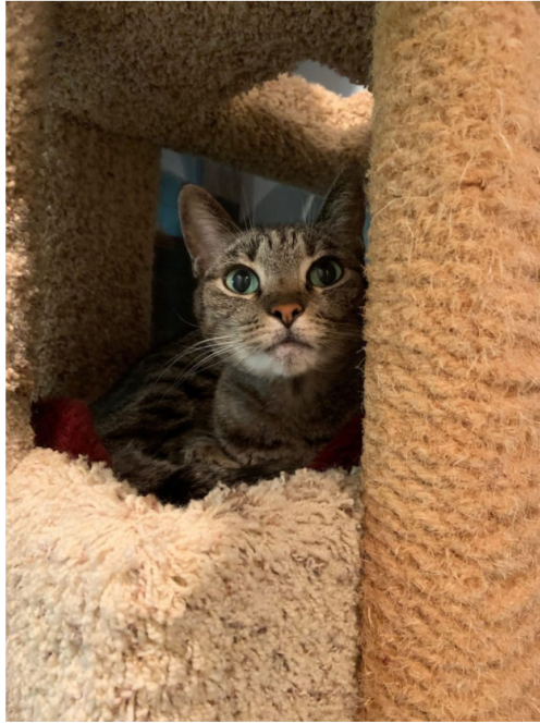
Frances, Bialik's own grumpy cat.

As a mom of two boys, do you think it's important for children to spend time with pets?